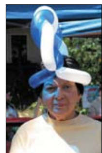
The Edwards community turned out in force for food and fun at the July barbeque in Aloha.